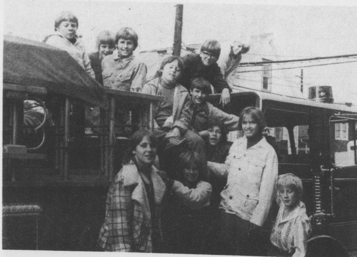
Kids got to climb all over the trucks at Friendship Co.'s open house.

USE YOUR VISA OR MASTERCARD G.C. MURPHY CO. - THE FRIENDLY STORE! 14 WEST MAIN ST.-MOUNT JOY, PA