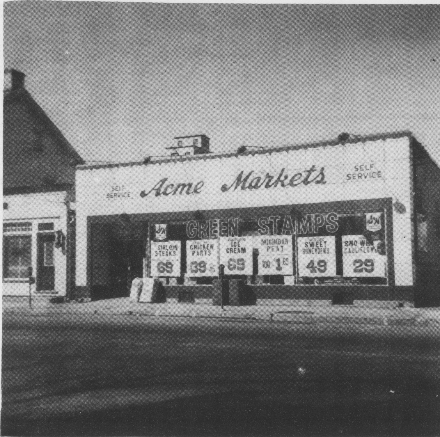
The old Acme market