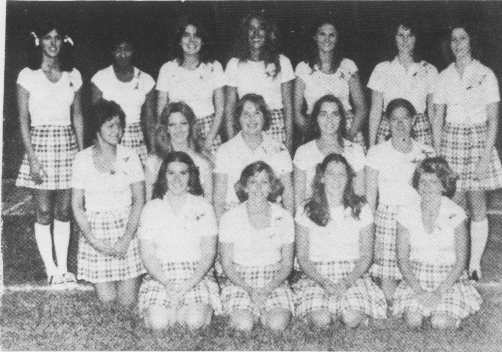
The alumni cheerleaders pose for our photographer

The alumni cheerleaders performed expertly.