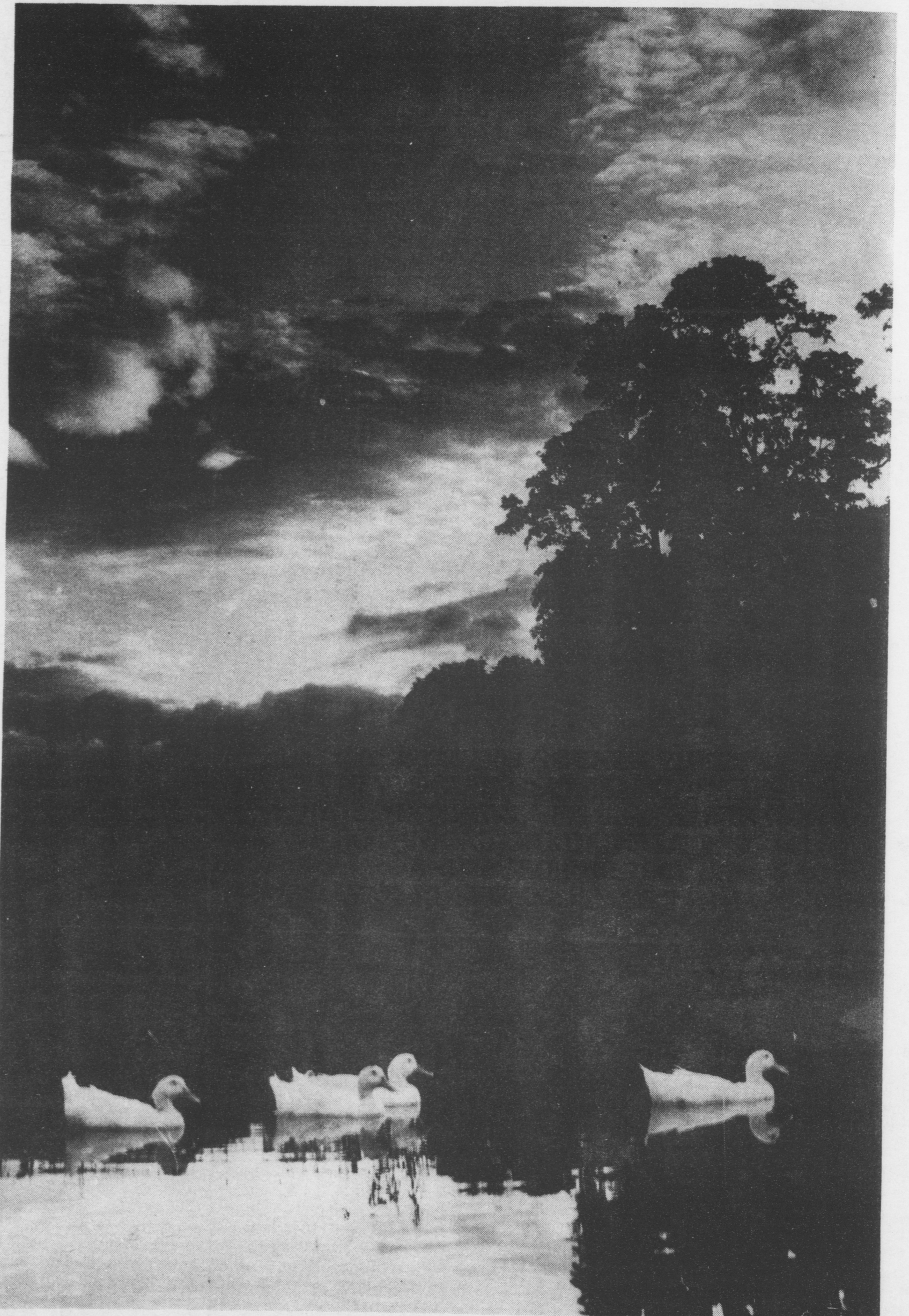
It was a great week for ducks: It rained... and then it rained some more. But, eventually, the sun broke through. Too bad, ducks! Let's hope it stays nice.