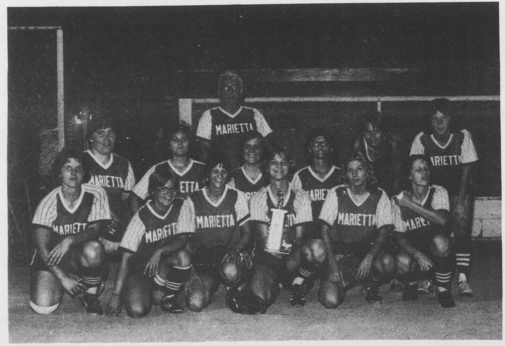
The winning team and coaches