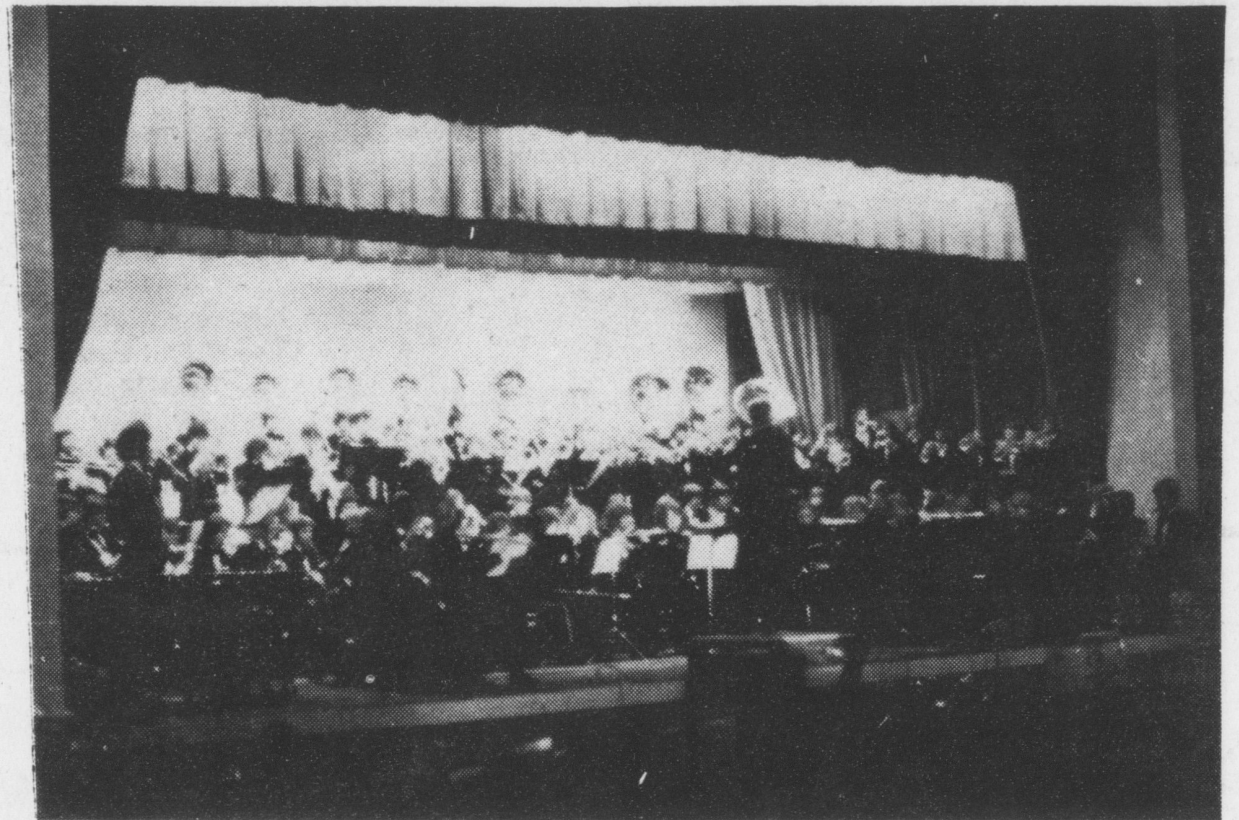
The Choctawatchee High School Band