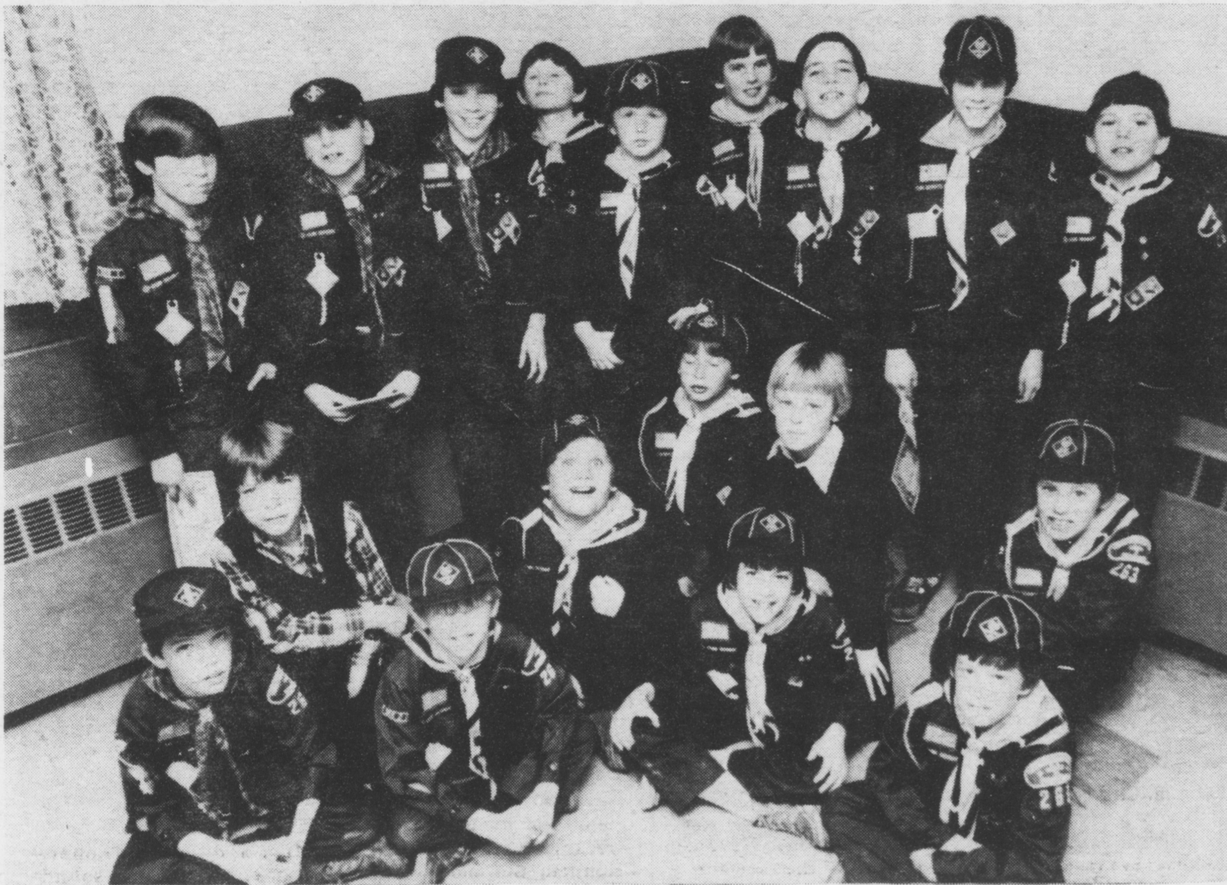
Scouts pose after the induction and banquet.