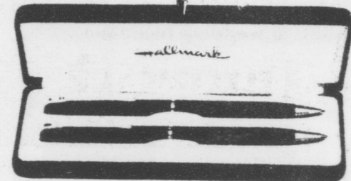
Comes in brown velvet gift case.

When you care enough to send the very best