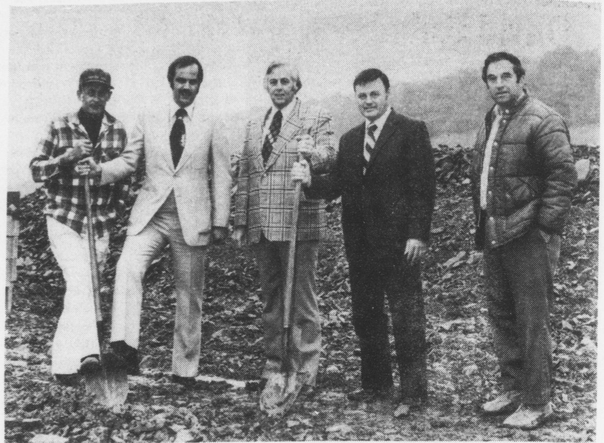
The ground breakage. Persons shown left to right are listed in order in article

Practices are scheduled from 12:30 to 3:30 PM. Fundamentals will be stressed for 7 weeks, followed by league-type play. Students should bring sneakers and dress warmly.