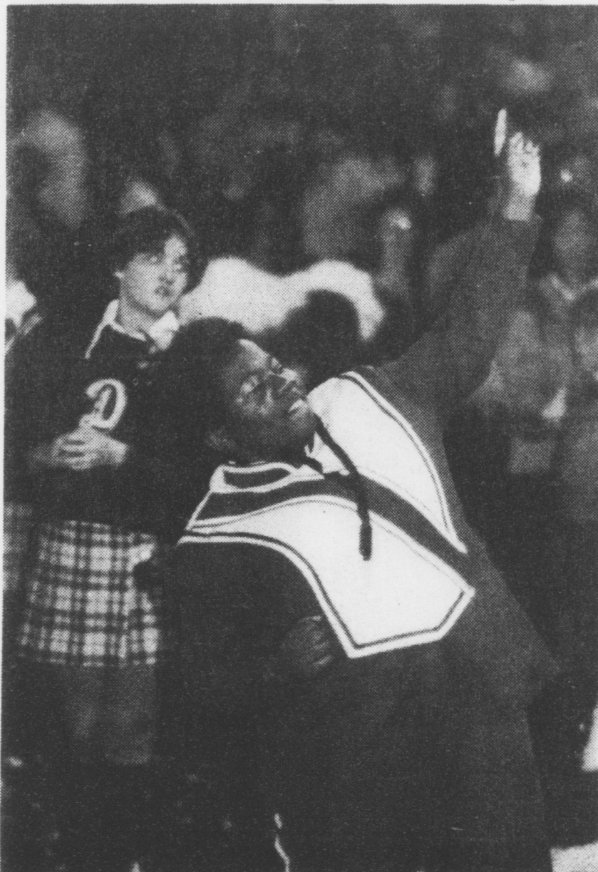
If skyward-pointing fingers are any indication, Donegal fans think their team is still number one.