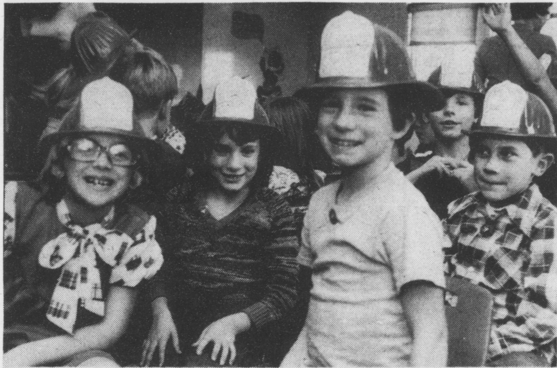
Kids got to wear the firemen's hats when the Maytown Fire Co. visited the elementary schools last week. It was National Fire Prevention week, and the firemen gave the students some safety tips.