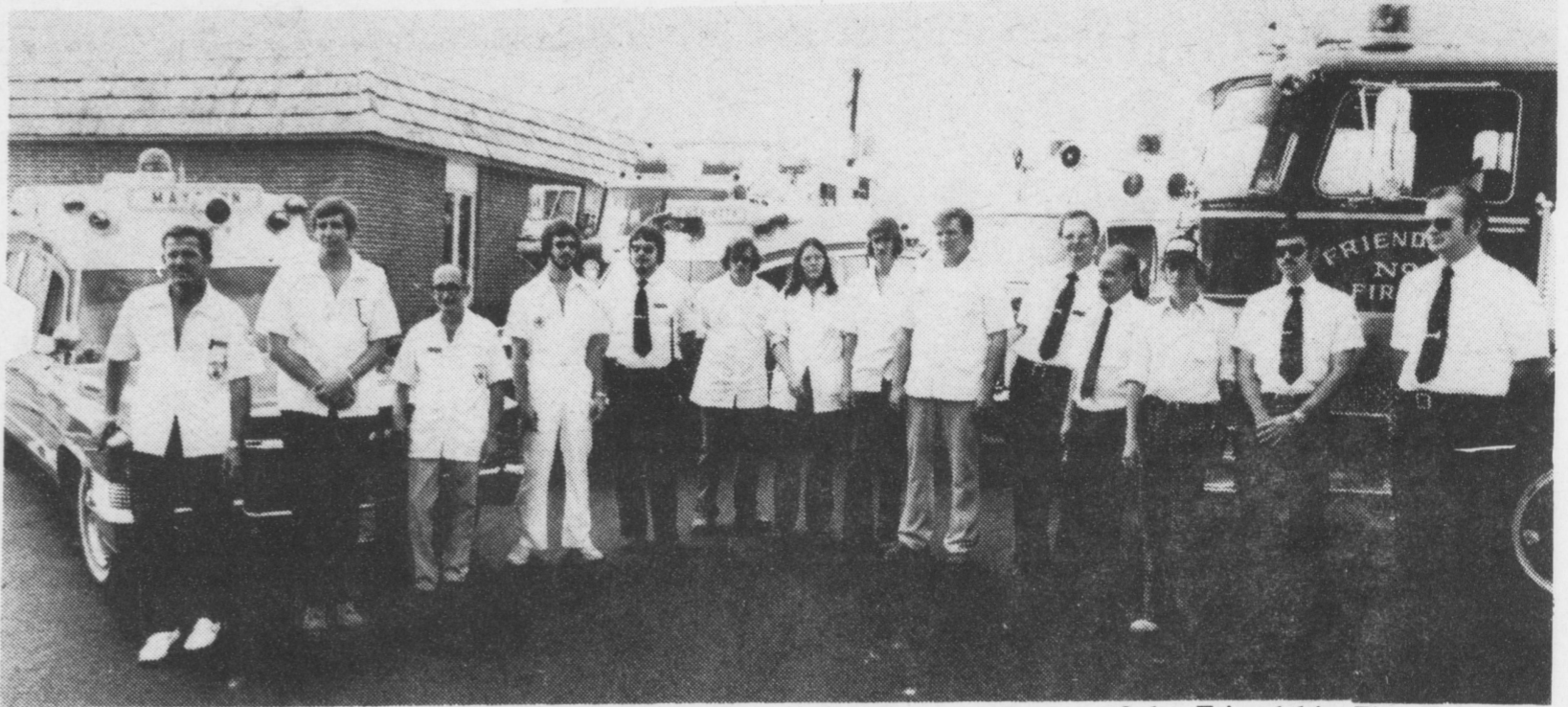
Members of the Maytown, Marietta, and Bainbridge Ambulances, and men of the Friendship Fire Co., pose with their vehicles in front of the new Medical Center.

Every Saturday at 7:30 p.m. Doors open at 6 p.m. Early Bird Games Start at 7:05 Food & Refreshments by Ladies Auxiliary of Maytown Fire Company.