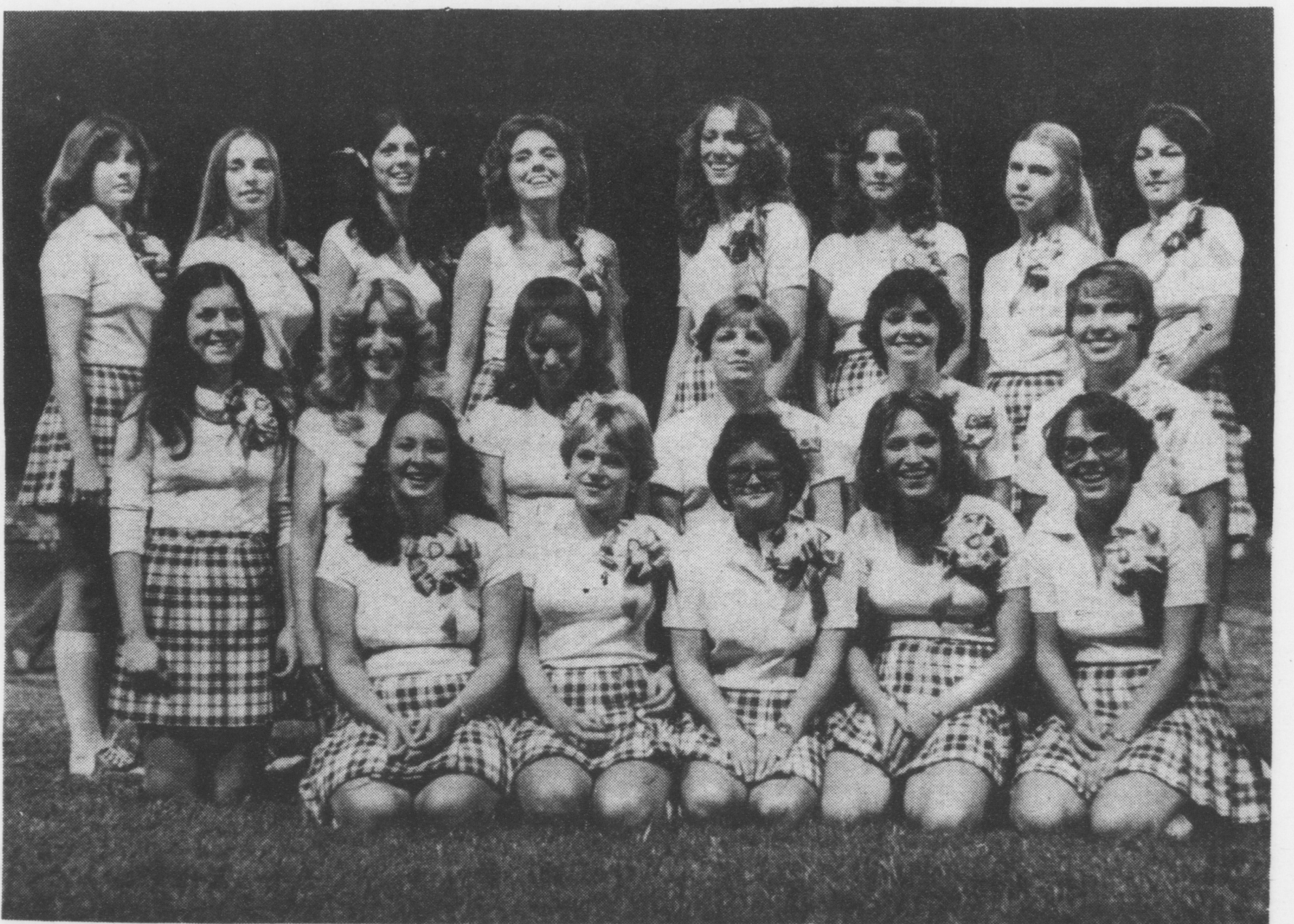
The alumni cheerleaders looking good under the new lights