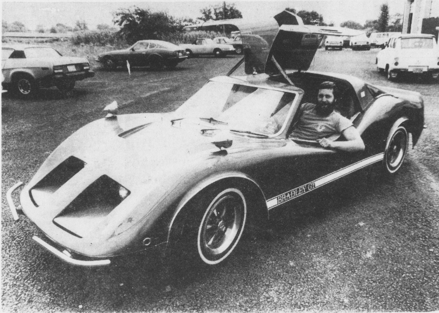
The Bradley in the lot of Strickler Imports near Mount Joy