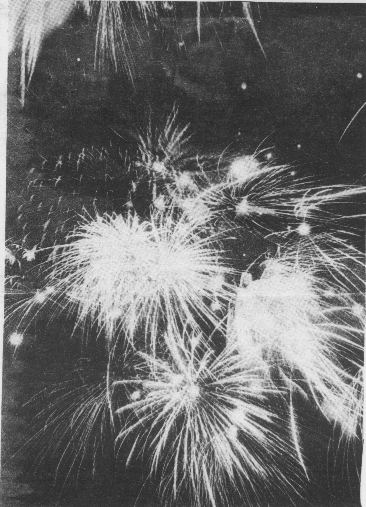
Fireworks exploded over Marietta July 3rd.