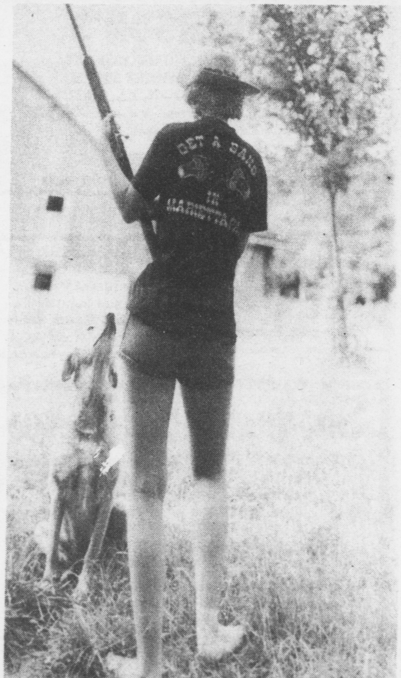
Is this the newest fashion fad?—The "frontier look" ala Marietta? Many local people helped the Jaycees advertise the Fourth of July festivities by wearing T-shirts which said, "Get a bang in Marietta."