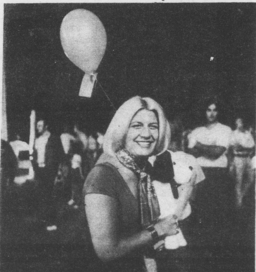
A reveller at Marietta War Memorial Park during the Independence Day celebrations. The Marietta Jaycees estimated that 20,000 people turned out to see their fireworks on the night of July 3.