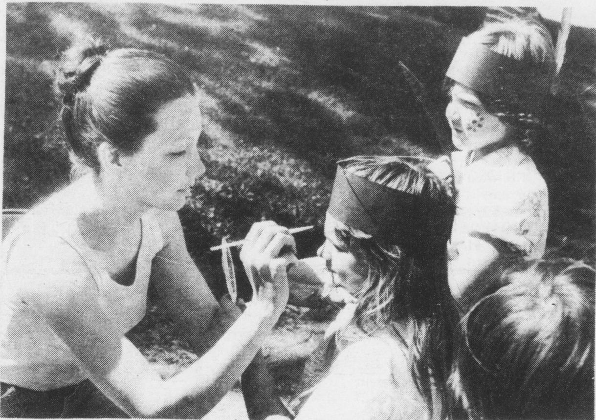
A small indian gets war paint at the Maytown festival.