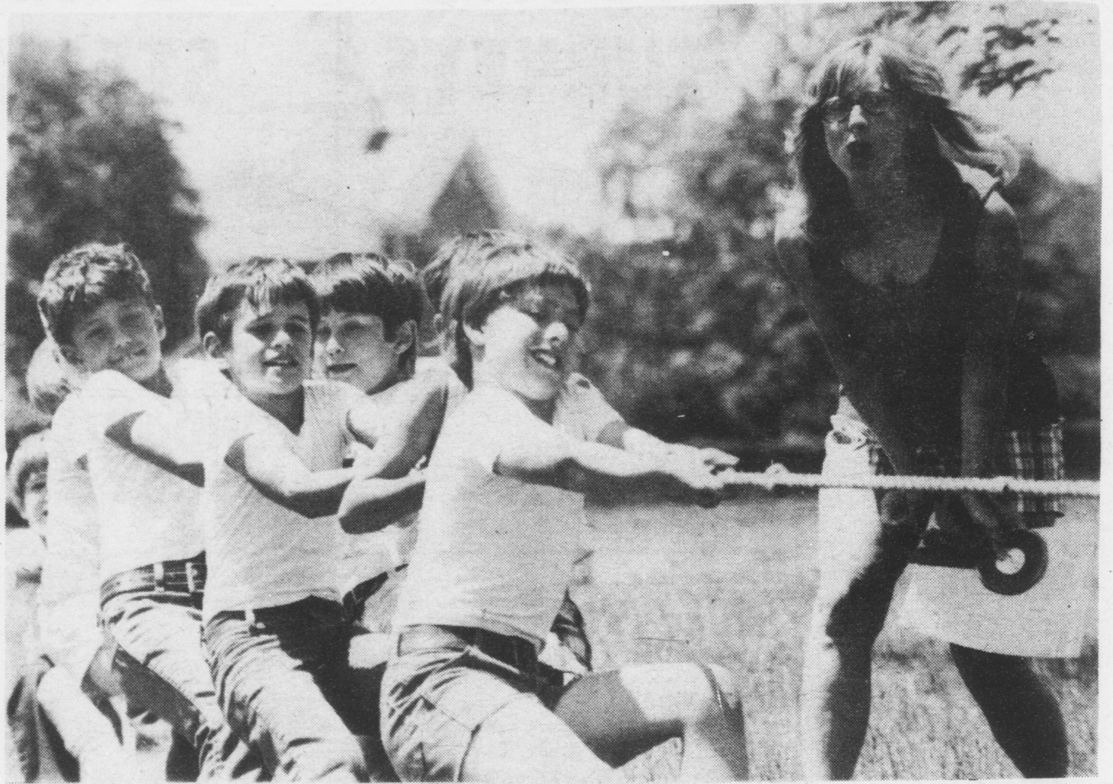
"Play Day" at Grandview School; the tug of war.