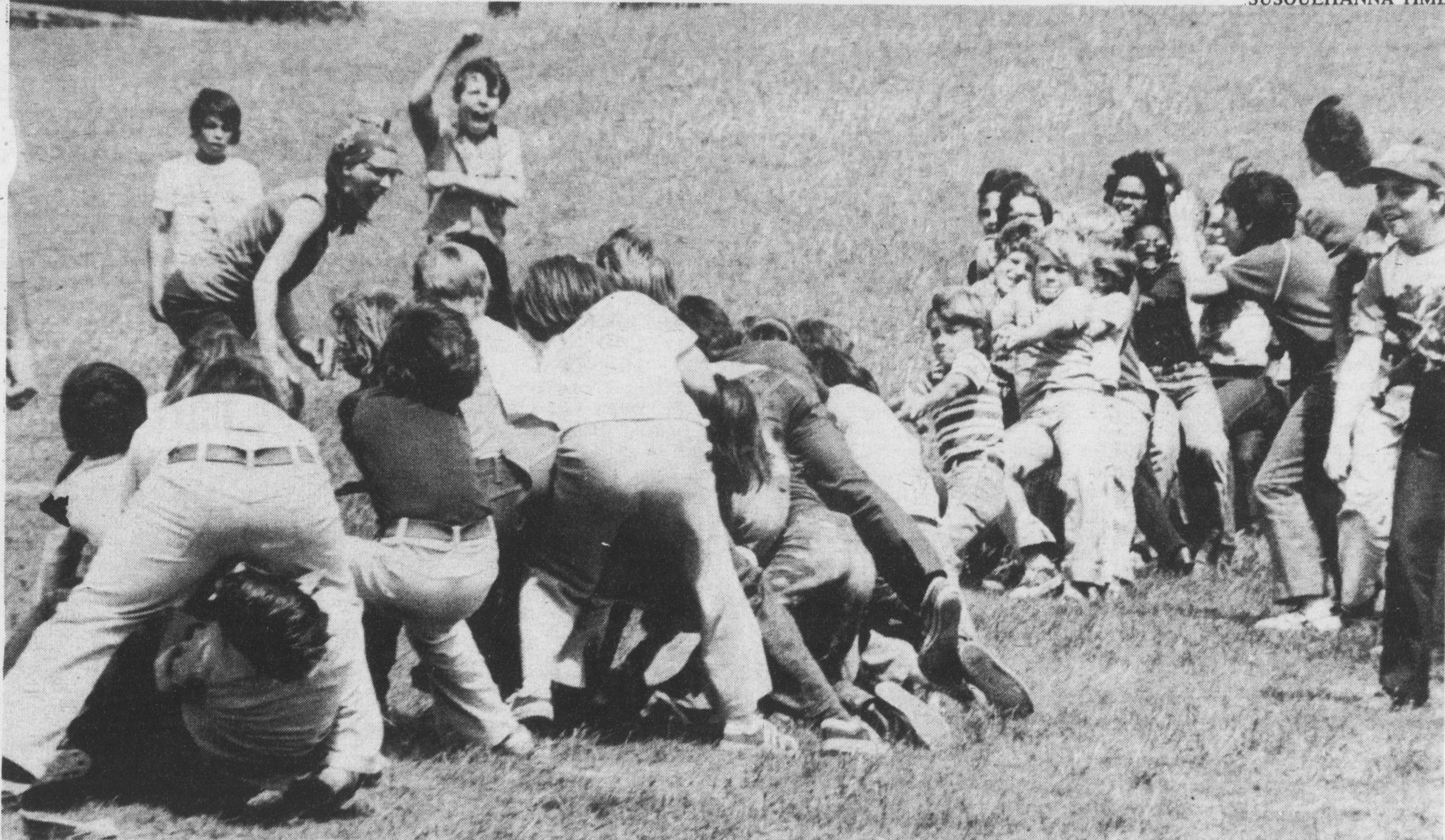
The tug-o-war caused a lot of excitement.