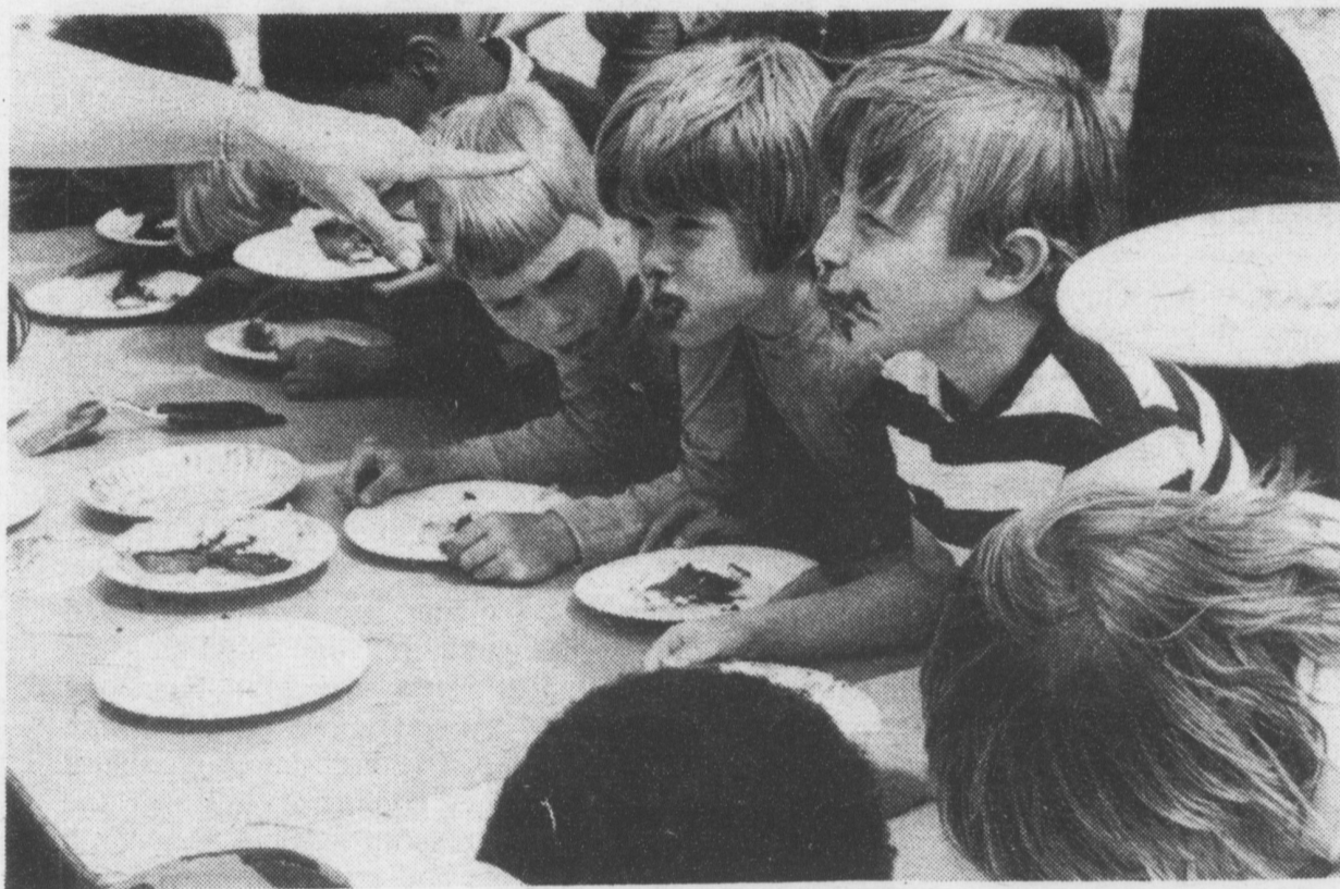
The anonymous hand points to a youngster who needs another piece of pie.