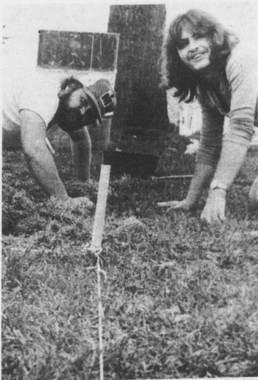
CETA employees lay out the site of the pavilion.