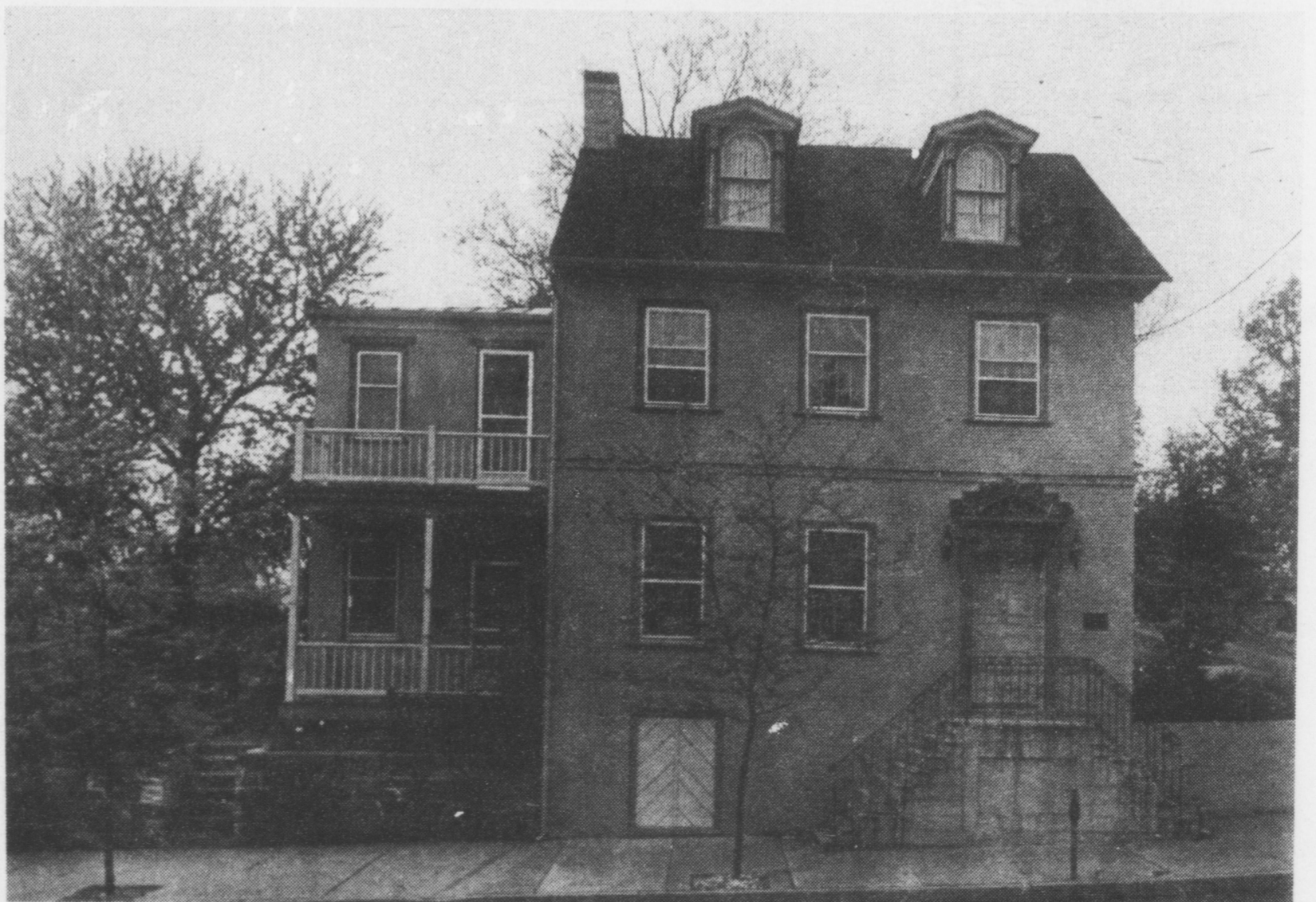
Exterior view of the Mifflin House