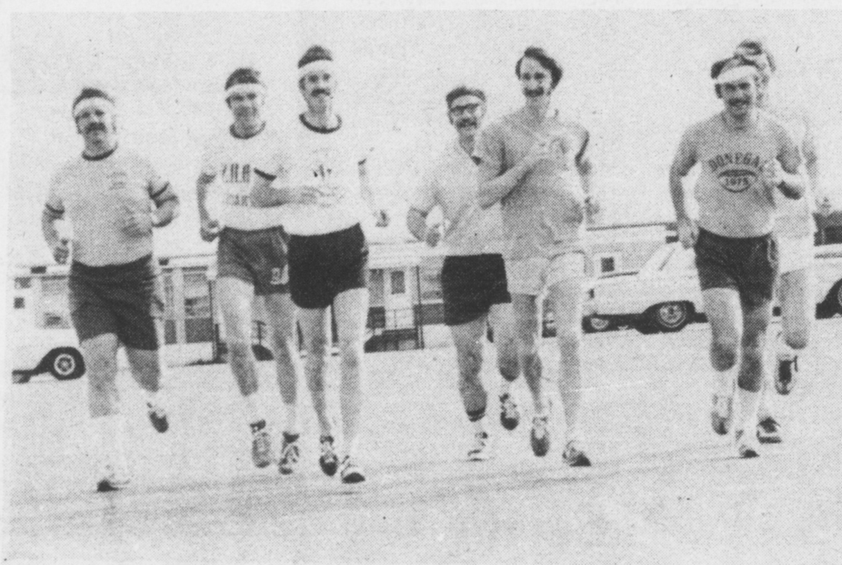
There they go.

Anyone who wants to join the Pacers should meet them after school near the DIG gym.