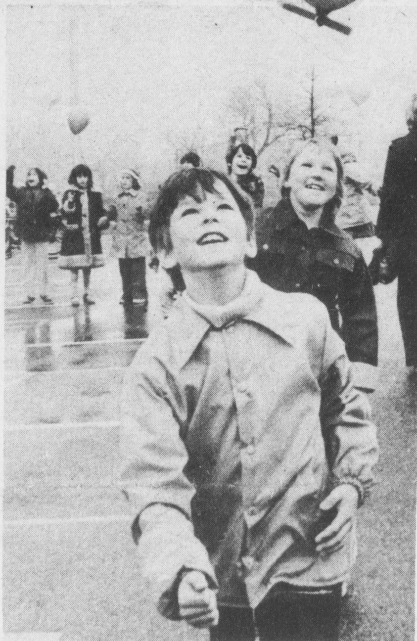
The big balloon launching at Riverview

Please be advised that all articles must be placed out at the curb for pickup.