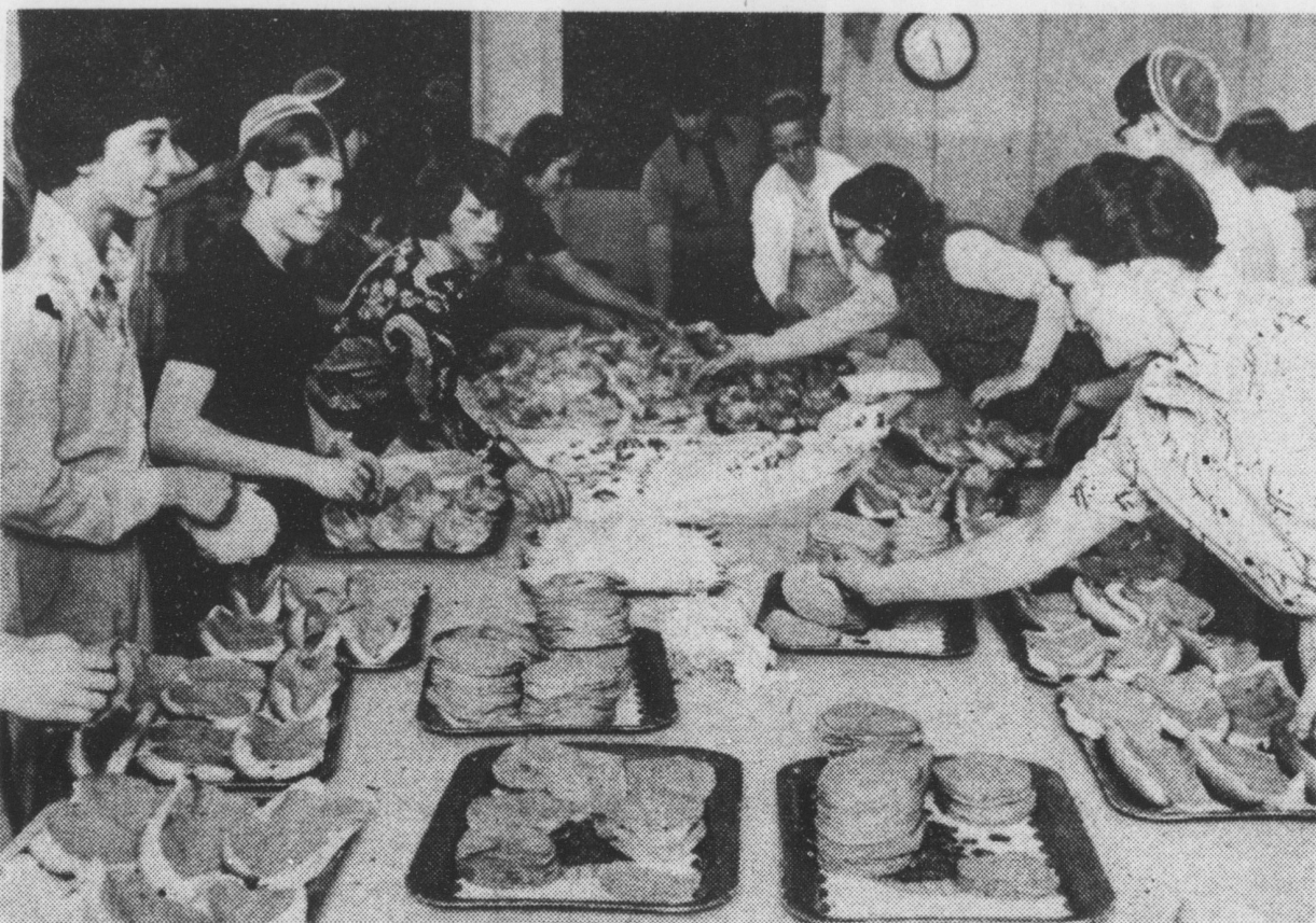
4300 hoagies were made at Kraybill last week. Starting at 5:00 a.m., the production lines were going full blast till mid-afternoon. Proceeds went to musical instruments and the school library. Raw materials for the hoagie manufacture (as well as cooked) came from Stehman's IGA.