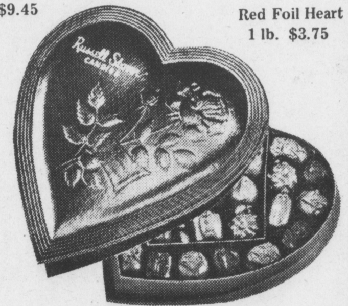
Red Foil Heart 1 lb. $3.75