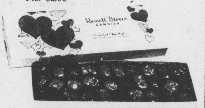
Assorted Chocolates 1 lb. $2.95

PHONE—684-2551 or 684-2552 FREE DELIVERY ALWAYS Open till 9:30—seven nights a week for your convenience