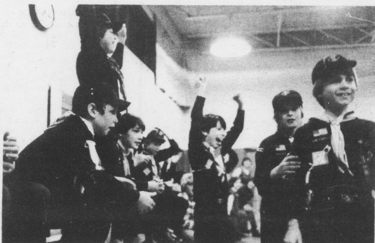
Cub Scouts of Pack 263 cheer wildly after a close heat in the Pinewood Derby.