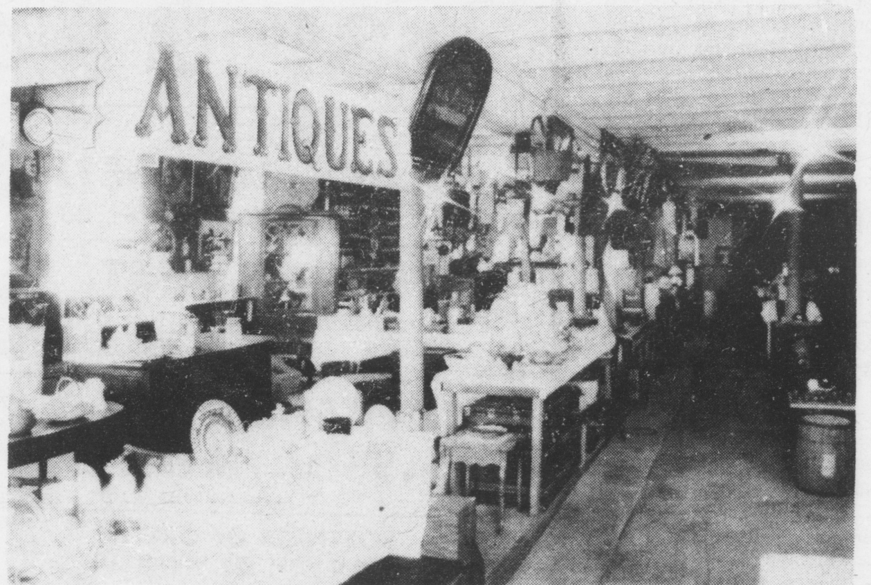
This shot of the new Flea Market shows the great variety of goods on sale there.