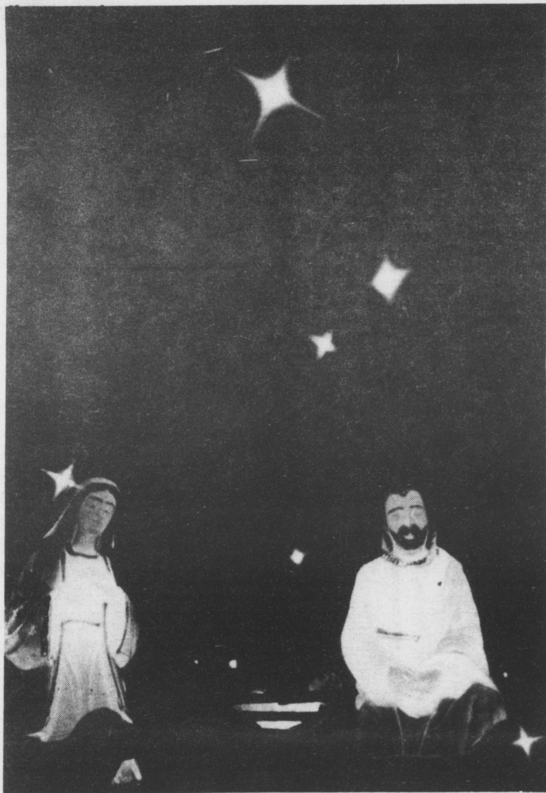
The East Donegal Jaycees have put up the Christmas lights in Maytown Square.