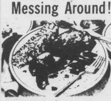
give her an IN SINK ERATOR and get rid of garbage problems for good!

After it's over, all any meal adds up to is garbage . . . leftovers that are a real "schmear" to wrap and scrap. Get her out of the garbage "bag" with the world's No. 1 stainless steel disposer. Gobbles up any kind of food waste, even steak bones and corn cobs. And no other disposer is so trouble