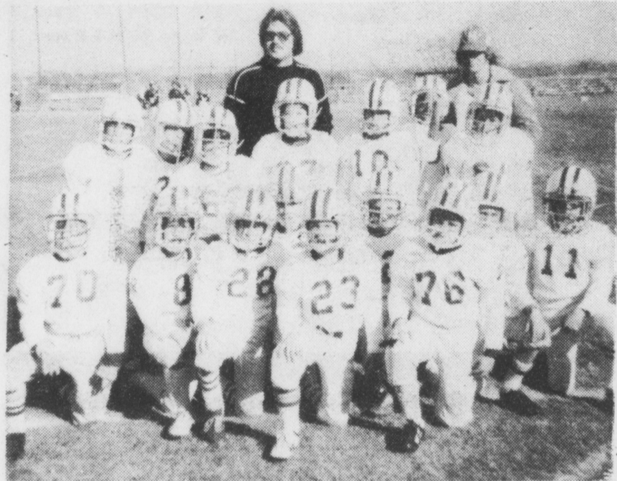
The D Team