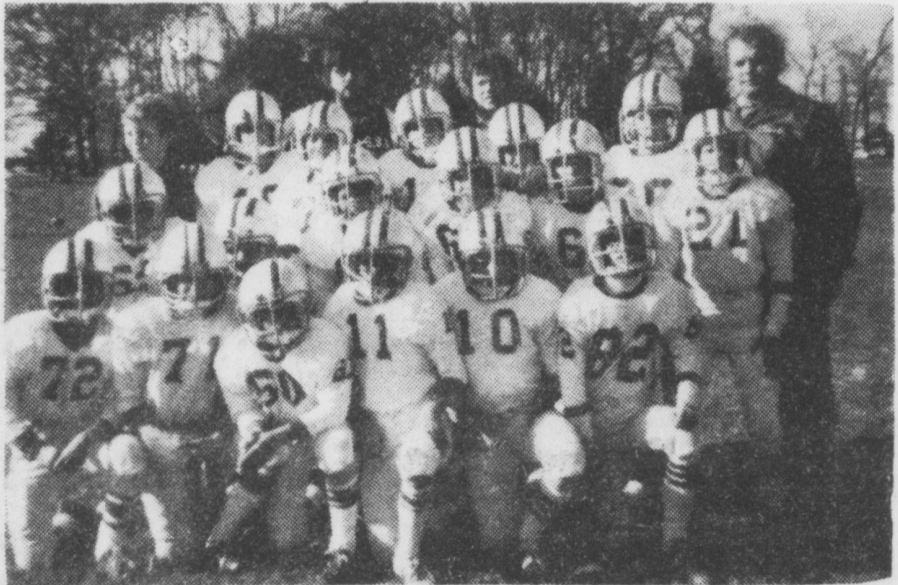
The B Team