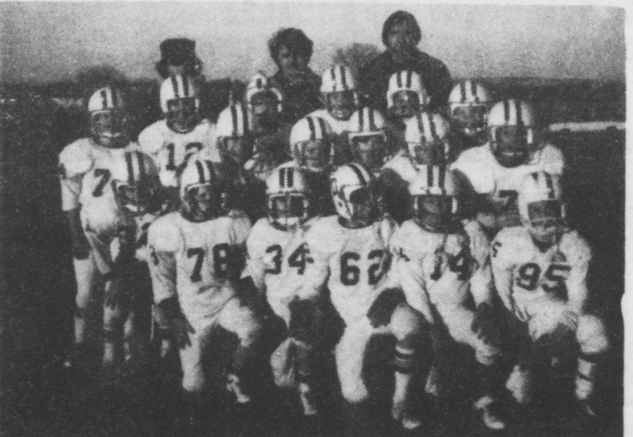
The C Team