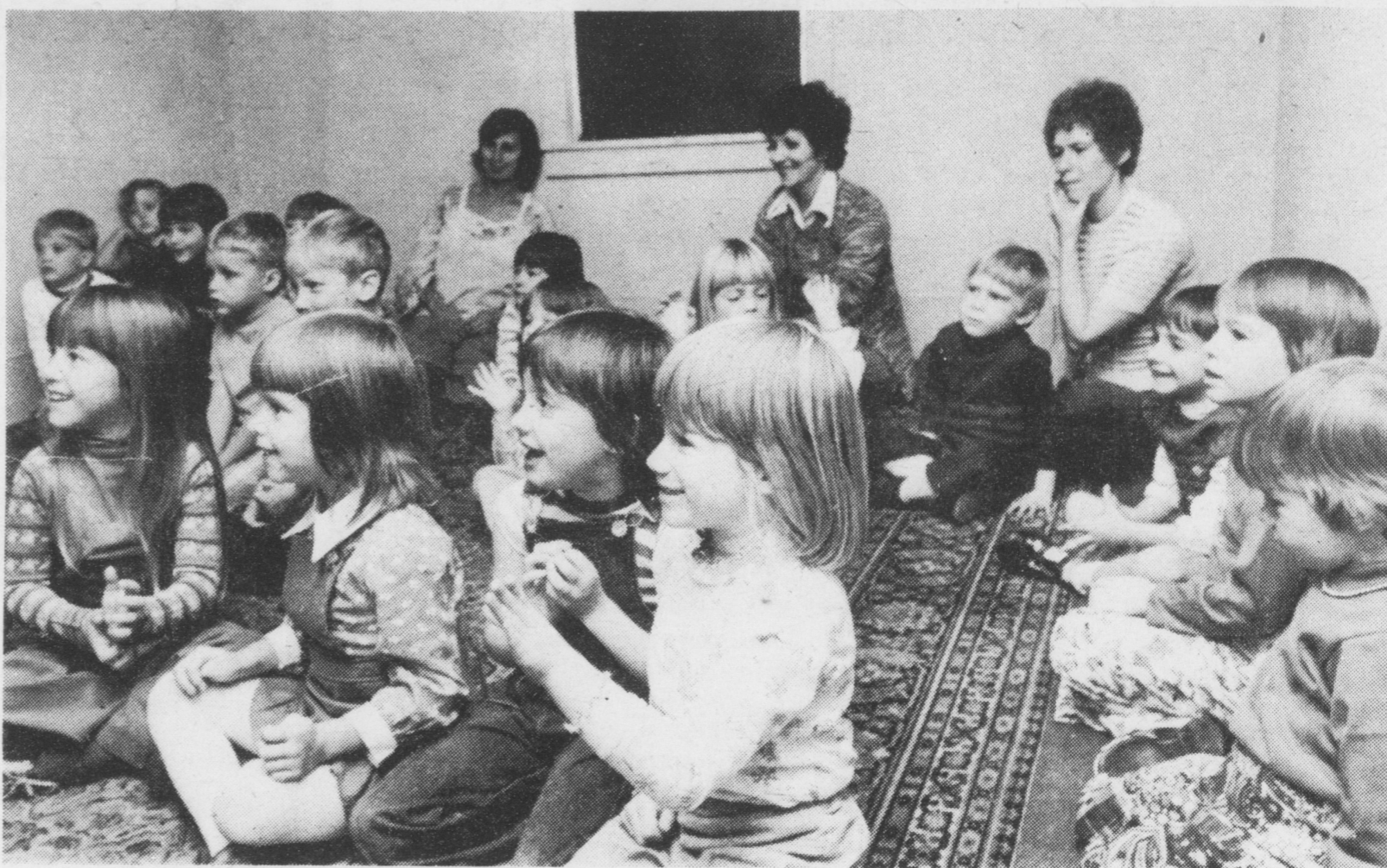
Photo shows kids enjoying storytime at the Mount Joy library.