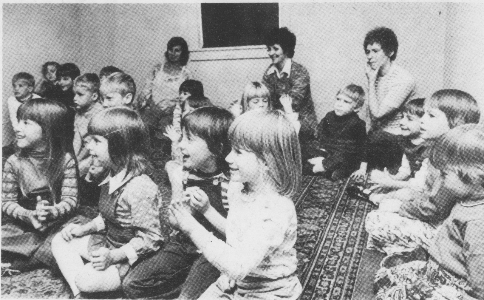
Photo shows kids enjoying storytime at the Mount Joy library.