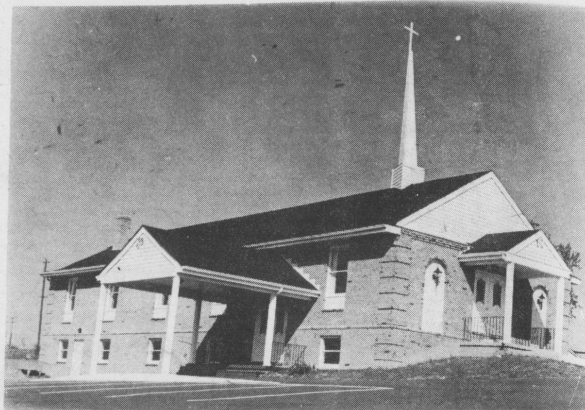
Photo shows the new Assembly of God Church at the intersection of Route 141 and Oremine Road.

The 51-member Choir presents several concerts on the campus each year and makes an extended tour in the spring.