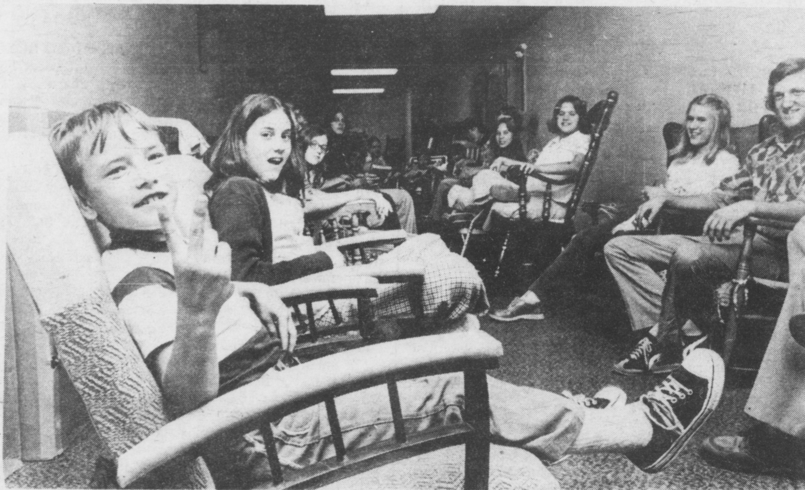
The Rockathon gets underway at Marietta Assembly of God Church.

Young people of Marietta Assembly of God Church held an all night "Rock-A-Thon" to raise money for missionaries around the