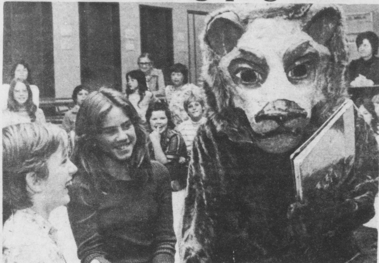
Photo shows the Limerick Lion with youngsters at Riverview Elementary School. The lion pats kids on the head, sits on teachers' laps, and roars a lot. If anyone pulls his tail, the lion hits the culprit with the big book he always carries.