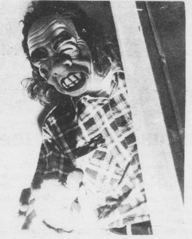
Photo shows a new member of the Marietta Jaycees. He will participate in the "Scream in the Dark" program this Halloween.