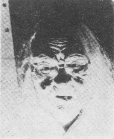
Photo shows a member of the Marietta Jaycees who drinks a strange potion every Halloween. Large quantities of this fluid affect his appearance and behavior.

The Marietta Jaycees and have their candy checked. There is no charge and it only takes a minute. That minute could save your child's life.