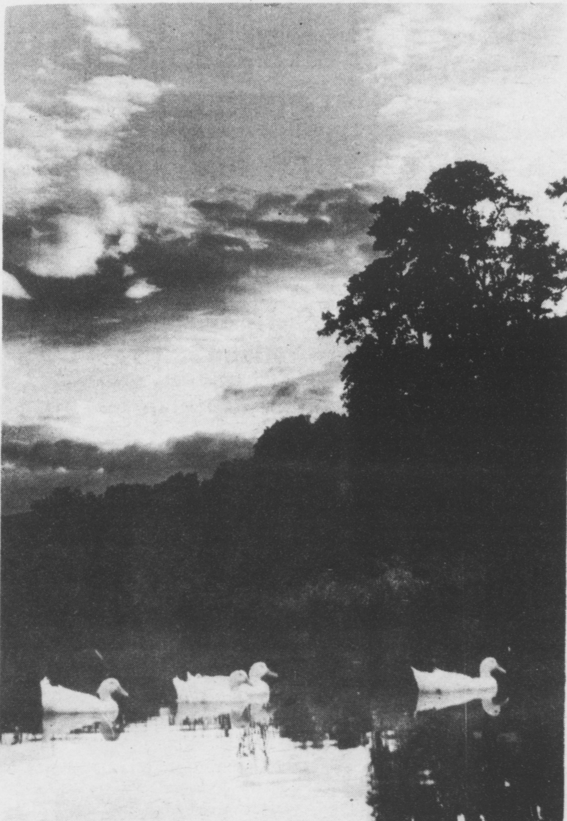
Even the ducks seemed glad to see the wind finally die last weekend, although they probably missed the rain. These birds on the Susquehanna Times pond near Chickentown are enjoying the peaceful sunset after the storm.

The children of the Zion Evangelical Lutheran Nursery School observed fire prevention week in many ways, one of which was a visit to the school from the Marietta Pioneer Fire Company.