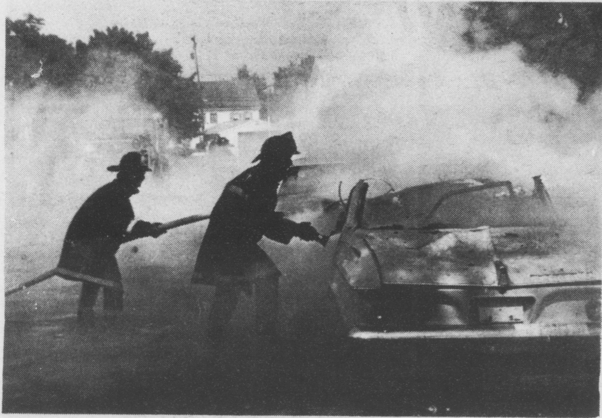
After the "power line" was removed, firemen were able to extinguish the blaze.