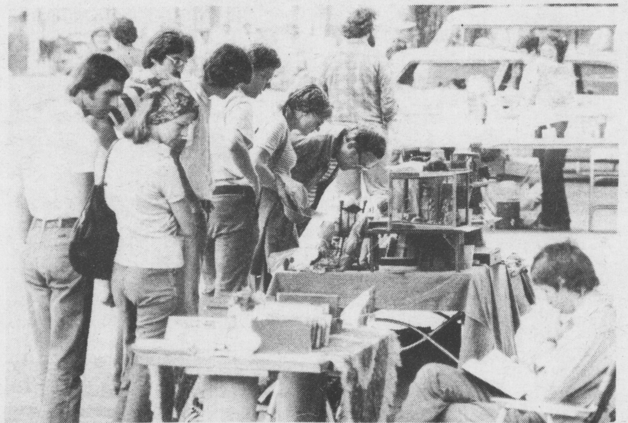
Potential buyers inspect wares on display at the Marietta Antiques and Crafts Show last weekend.