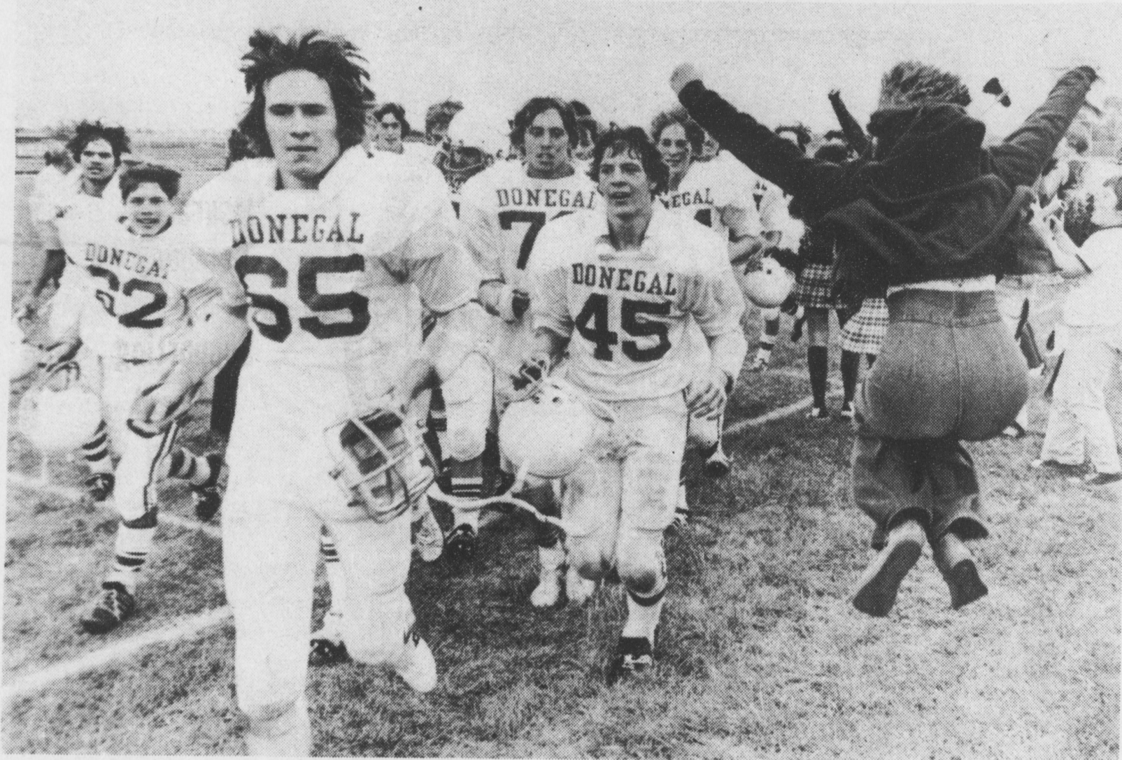
A fan jumps for joy as the victorious Donegal Indians jogged off the field.