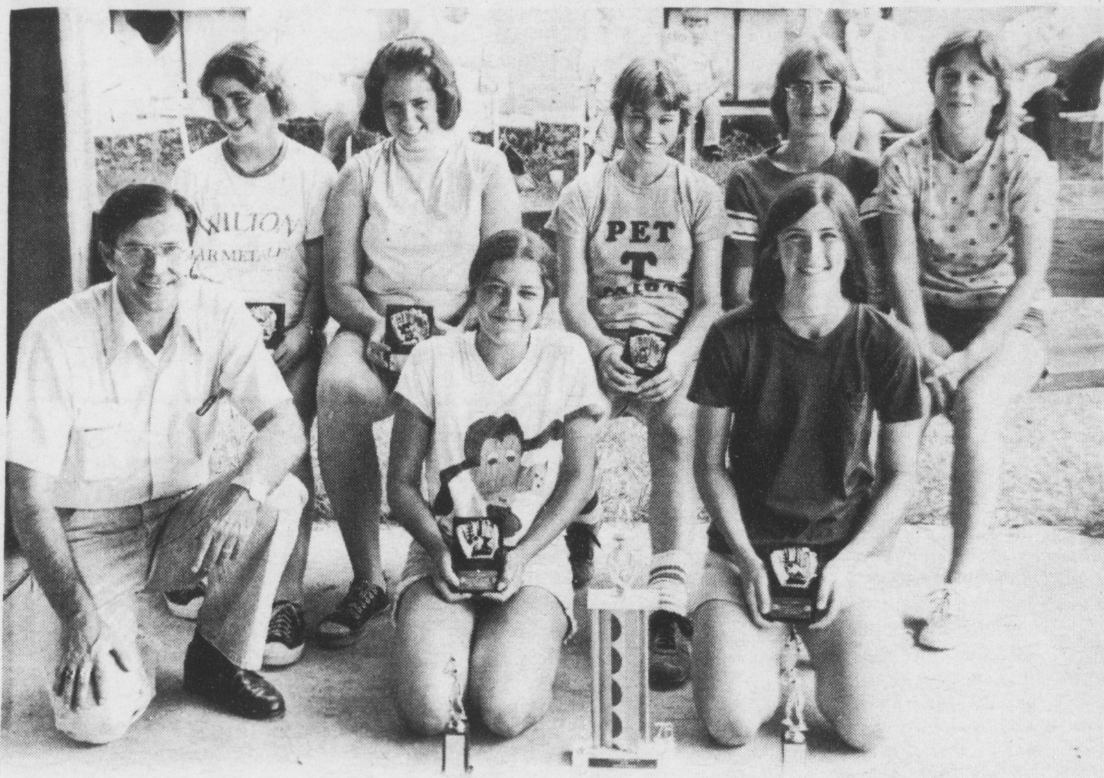
Photo shows some members of the Maytown Miracles softball team, champions of the E-town- Donegal Softball League. From left to right are; front row- coach