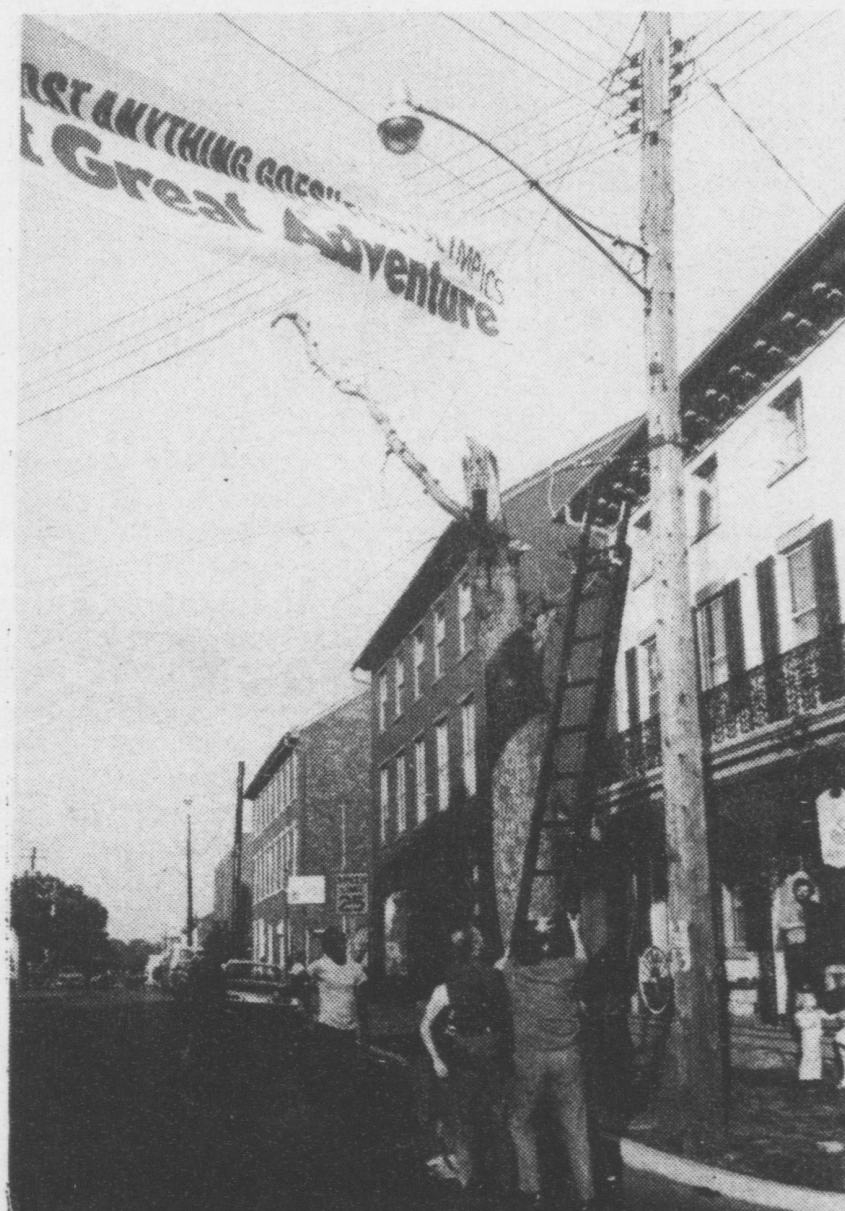
Jaycees raise a banner announcing Marietta's participation in TV fun olympics.