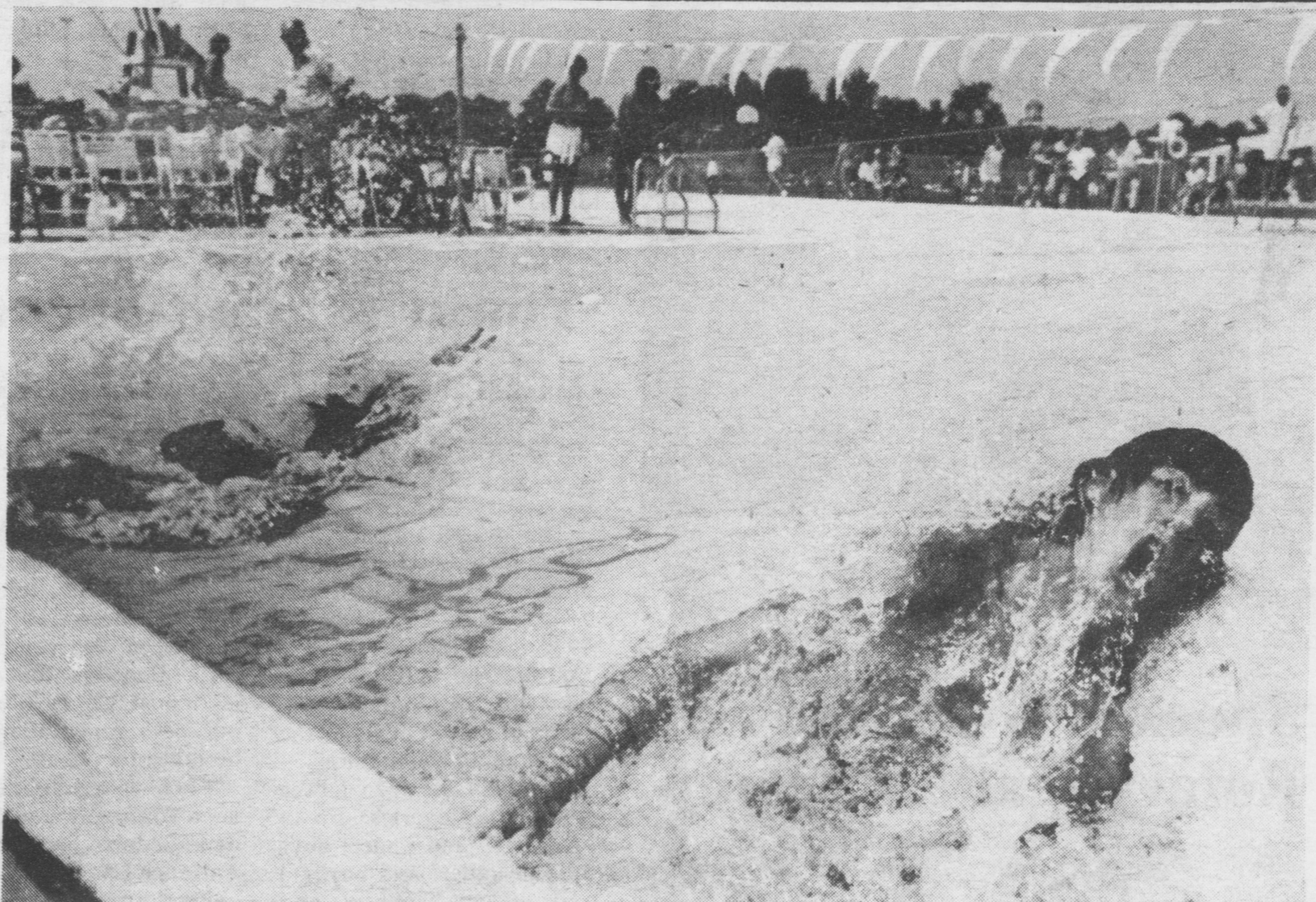
Swimmer makes a turn during race at Mount Joy pool.

develop a mini shopping center. "The area surveyed has a great potential for development," the spokesman said.