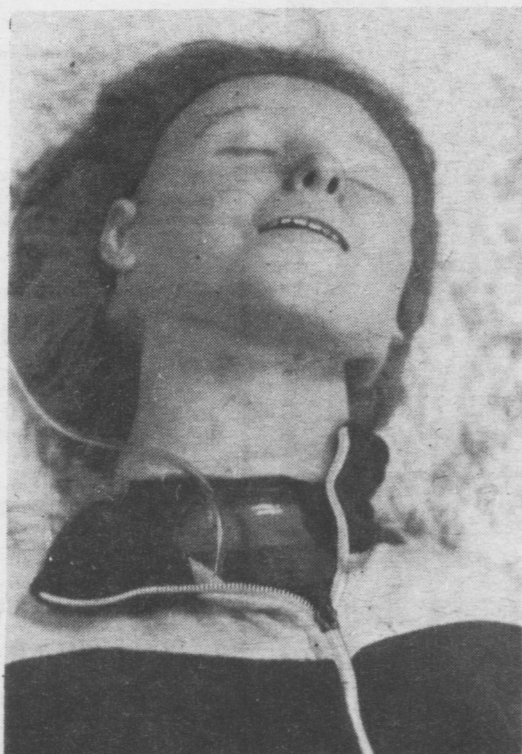
Photo shows Resusci-Anne, the dummy used in training for cardio-pulmonary resuscitation.