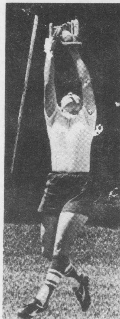
Marietta outfielder hawks one in.