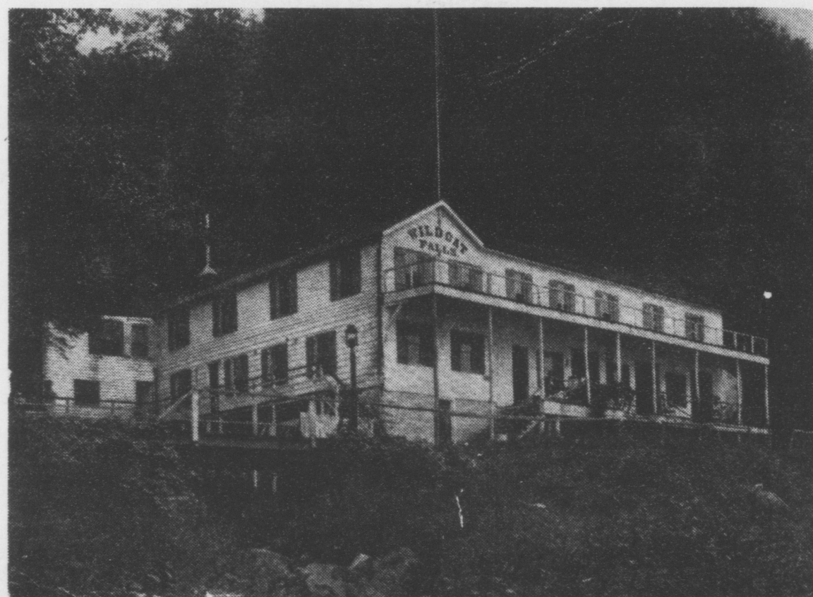
The old Wild Cat Falls Hotel.