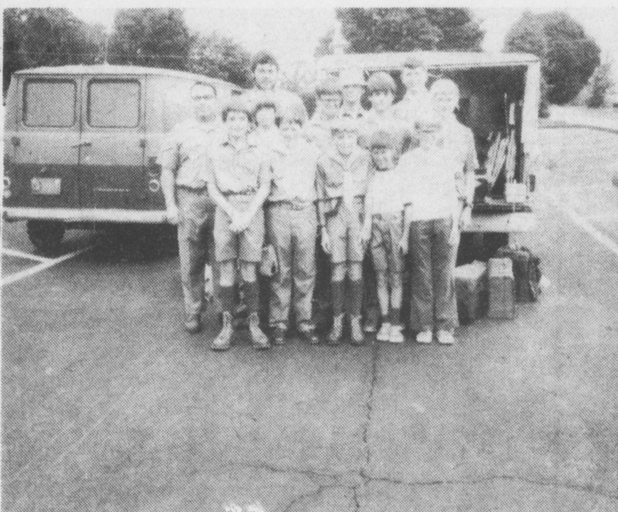
Scout Troop 63 gets ready to roll.

Mount Joy hosts this coming Tuesday, July 20th - Lititz Springs at our pool at 6:15. This should be an interesting meet so come out and support the team.