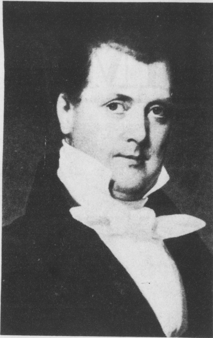
James Buchanan as an ambitious young lawyer.