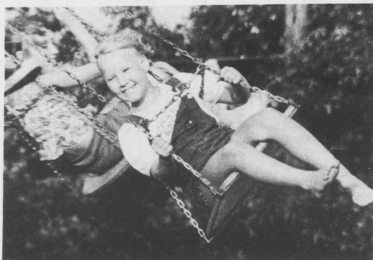
There were plenty of rides at the carnival.

to pour. The chorus finished their medley, but the planned fireworks had to be postponed to the 4th because of the rain.