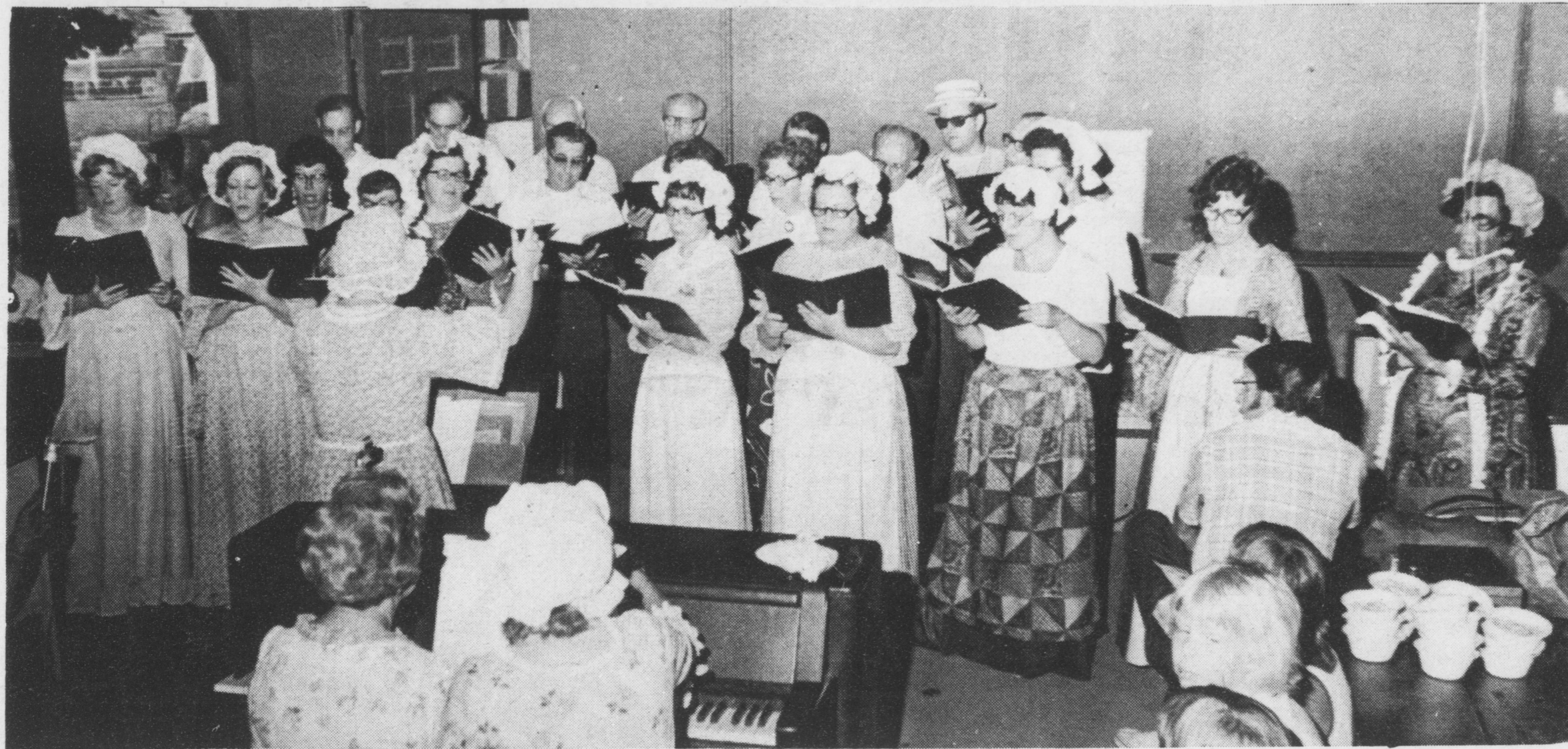
The Marietta Community Chorus sang patriotic songs in the park last July 3d. They were halfway through 'It's a Grand Old Flag' when thunder crashed and rain began

to pour. The chorus finished their medley, but the planned fireworks had to be postponed to the 4th because of the rain.