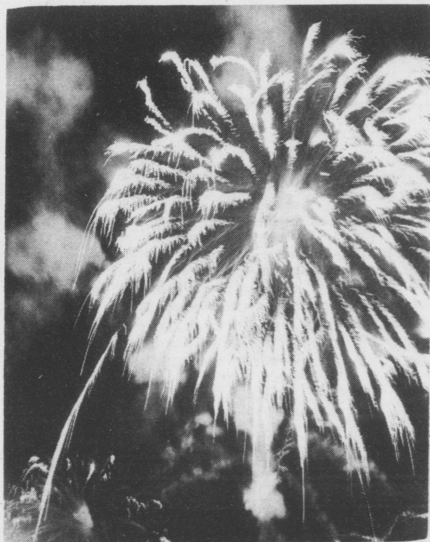
Photographer Corky Flick captured the rockets' red glare (in black and white) in this time exposure.