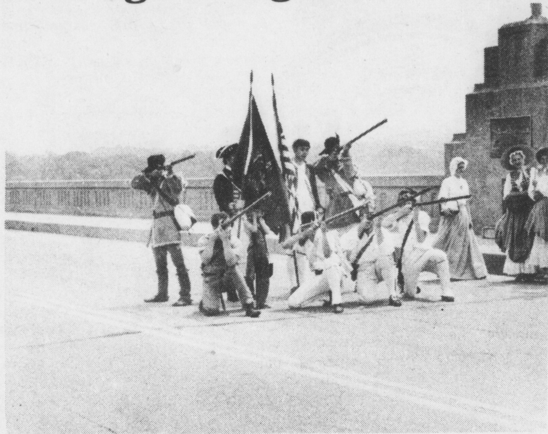
The Bicentennial wagon train was halted on the Columbia Bridge by a band of local vigilantes when they tried to enter Lancaster County. The Donegal Rangers leveled their rifles at the approaching caravan and asked them to state their business.