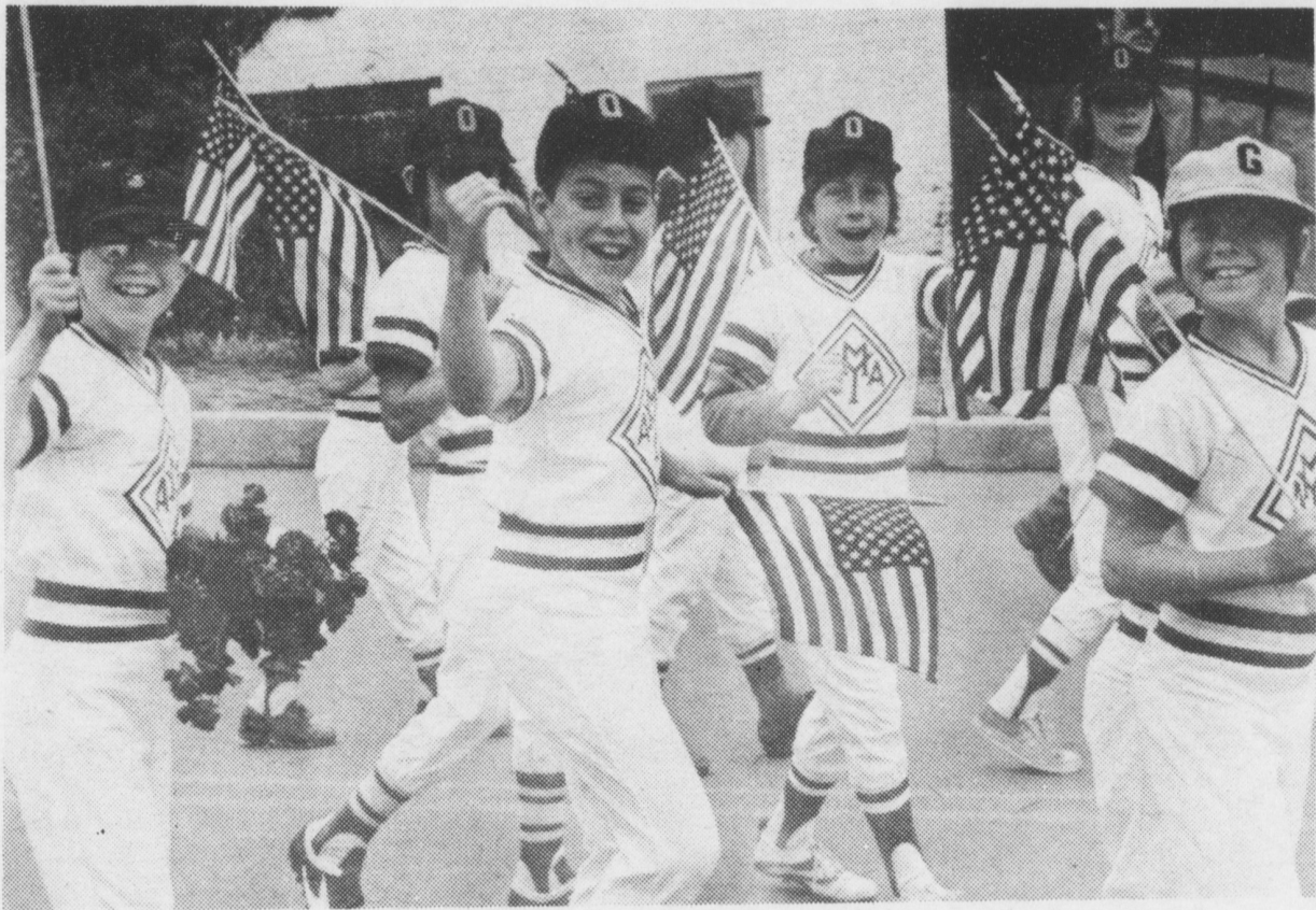
The MYAA marches down Market St. in the Marietta Memorial Day parade.