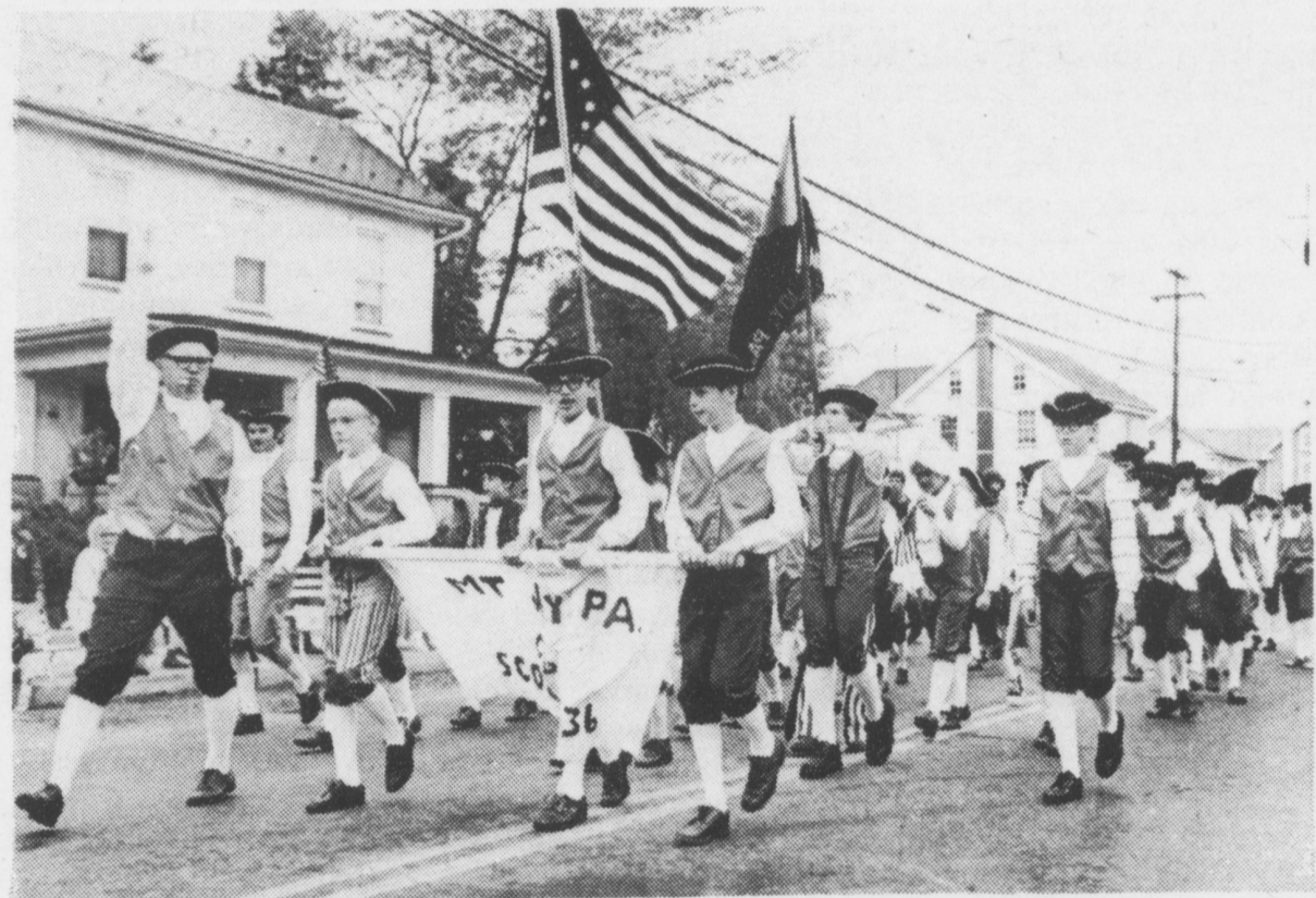
Cub Scout pack 136 marches in the Mount Joy Memorial Day parade.