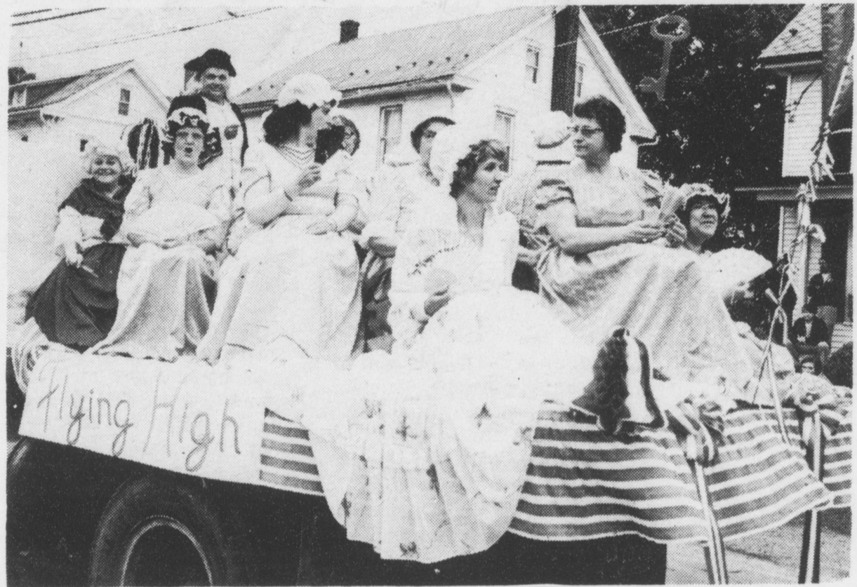
The Gibson Girls sang as their prize winning float rolled down the street in the Mount Joy parade.

The Vo-Tech float consisting of a Liberty Bell, made of brick will be entered in the July 4 parade planned for Philadelphia. A brick company will sponsor the float in that parade.