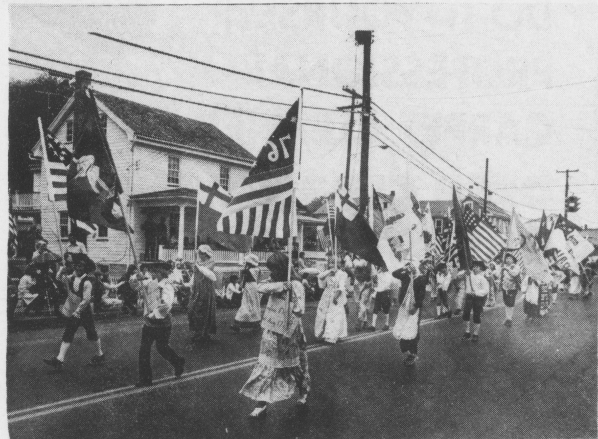
Forty-eight flags of America were carried by Grandview students in the Mount Joy Memorial Day parade. The flags are a gift from Stehman's IGA.

Students from Grandview Elementary School carried 48 flags of America in the Mount Joy Memorial Day and birthday parade on Saturday.