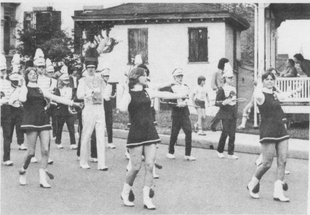
Donegal High School drum majorettes and marching band in the Marietta Memorial Day parade.