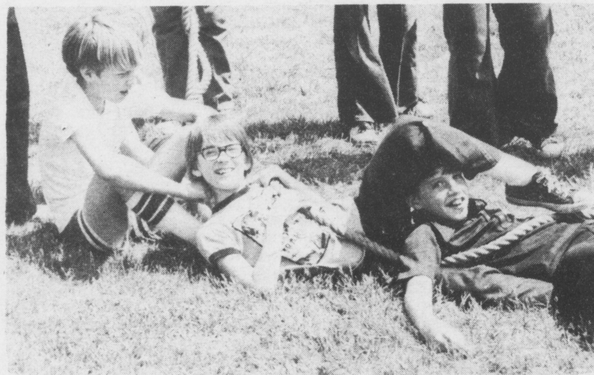
These youngsters at Grandview's play day lost the tug-of-war but enjoyed falling down.