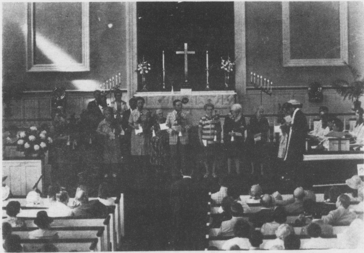
Honored members of Glossbrenner